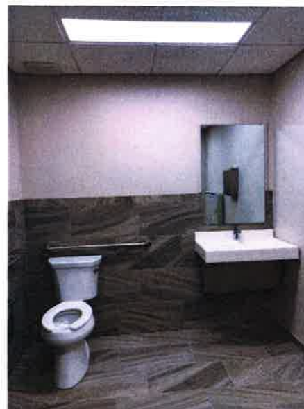
Unisex Rest Room