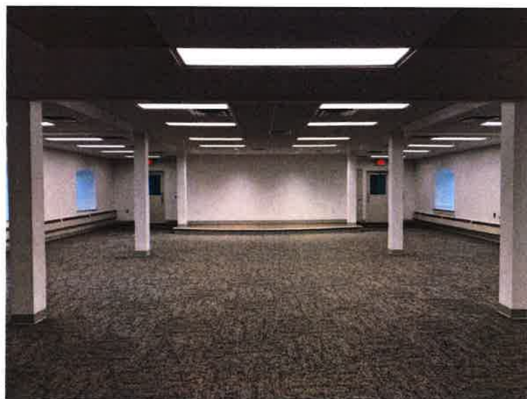
Fellowship Hall June 23, 2020

Enjoy these photos of the completed construction in Fellowship Hall and in the new Unisex handicap accessible bathroom. On Friday, June 26, we received notice from our general contractor, Ventresca Bros., that Fellowship Hall and bathroom areas are available to members and employees of Green Hill Church.